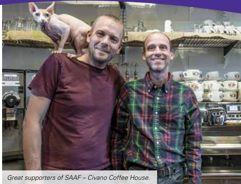
Great supporters of SAAF – Civano Coffee House.

The following is a listing of all corporate, foundation, and non-profit organizations who have helped support SAAF during 2017 with cash gifts. Please consider supporting these businesses as they have provided essential services and programs for the people SAAF serves.