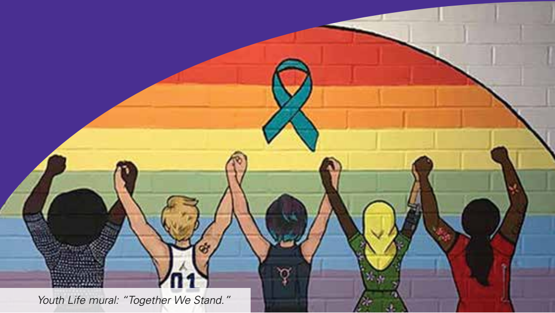
Youth Life mural: "Together We Stand."