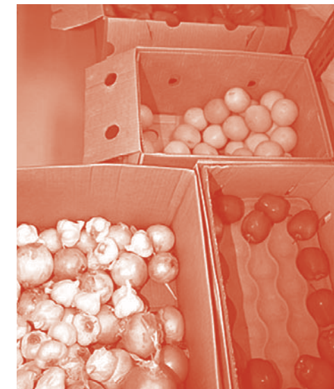
Fresh produce, provided through SAAF's Grace Trust Food Pantry, is a staple for many SAAF clients