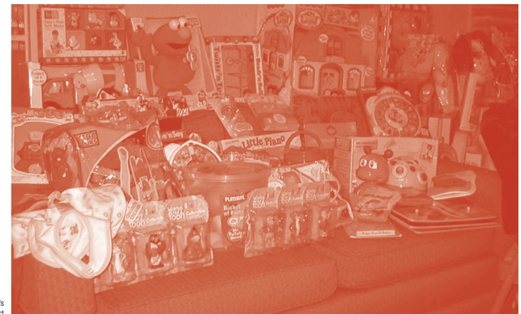
Toys donated for SAAF's annual Holiday Project

– Participant in SAAF's Complementary Therapies Program