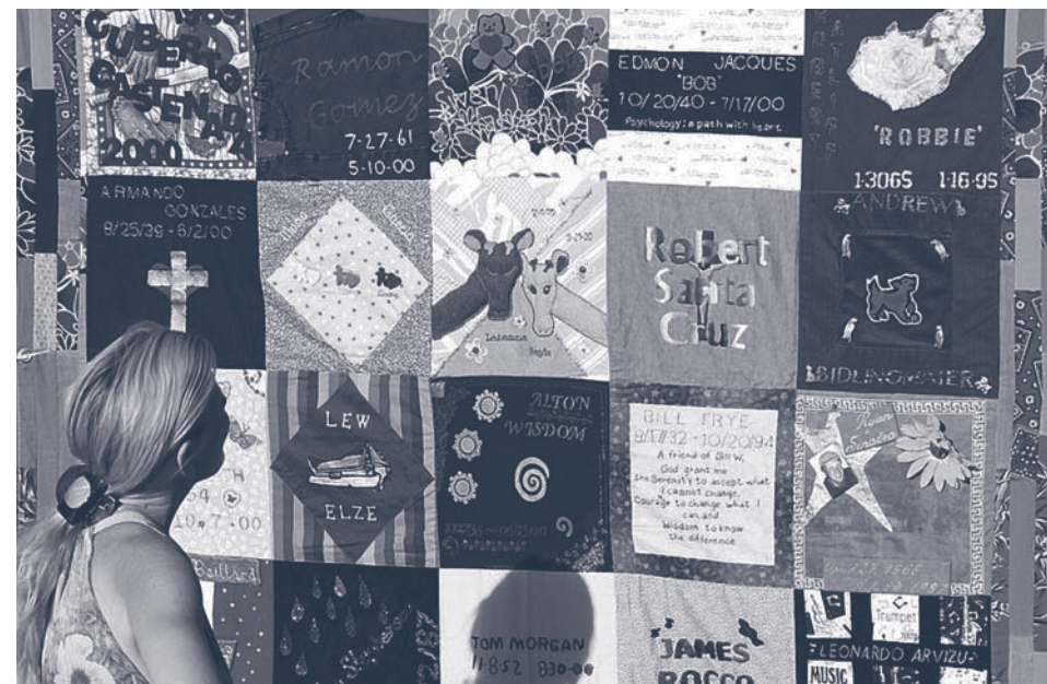
Panel from Tucson AIDS Memorial Quilt