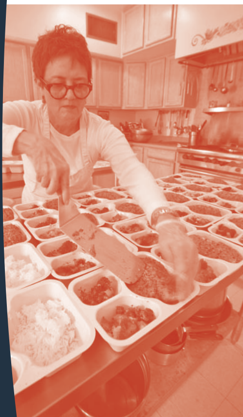
Volunteers prepare meals for SAAF's Food For Life Program

During this past year, SAAF provided services to the greatest number of people in its history, serving 1,060 people living with HIV/AIDS and their household members. Of these, 108 were new clients to SAAF.