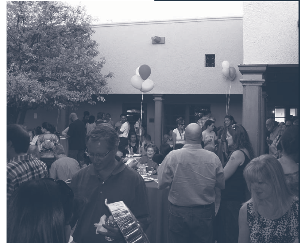
2011 SAAF/ TIHAN/ Wingspan Volunteer Appreciation event