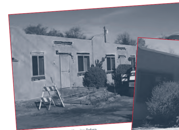
Glenn Street Housing Before