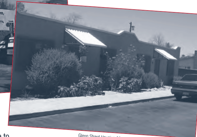
Glenn Street Housing After

It is now 2012. SAAF staff recognized that the apartments were not energy efficient, so when the opportunity arose to work with the well-recognized Drachman Institute (the research and public service unit of The College of Architecture and Landscape Architecture, The University of Arizona) to design a more livable, sustainable, comfortable and expanded multi-family development, SAAF staff and residents jumped on board. Thanks to a Community Development Block Grant from the City of Tucson, the Drachman Institute initiated the new property design, and the well-respected architectural firm of Poster Frost Mirto, Inc. completed the architecture and engineering plans.